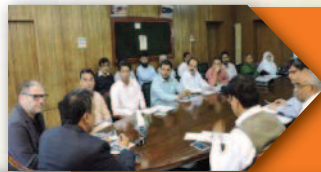
USAID delegation attending second DST meeting in Sukkur along with senior level officials from partner organizations chaired by the Deputy Commissioner.

*Seven schools are completed, of which, 4 schools are handed over to School Education Department, Government of Sindh.