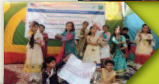
Children performing during in International Literacy Day celebrations at GGPS Haji Lal Bux Shaikh, Larkana.