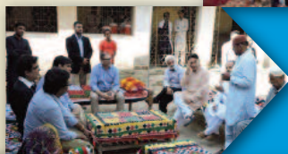
USAID mission during meetings with Community in Village Dodanko, Sukkur.