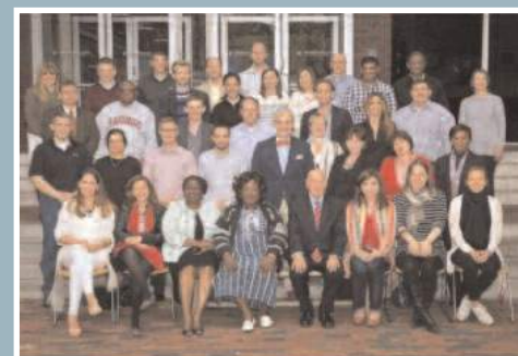
Global Change Agents: Leading with Commitment, Creativity, and Courage May 15 - 20 2016