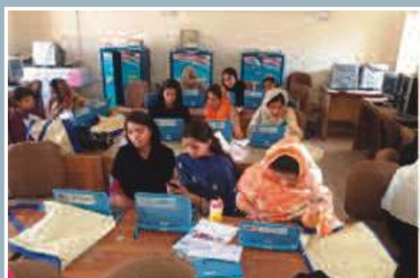
Student busy in ICT Class Practice

SCDP in collaboration with INTEL Pakistan is providing ICT skills training to 800 teachers, 4,000 students (grades 6-10) and 4,000 out-of-school adolescents, youth and adults from the local communities of SBEP schools, both construction and neighbouring ones.