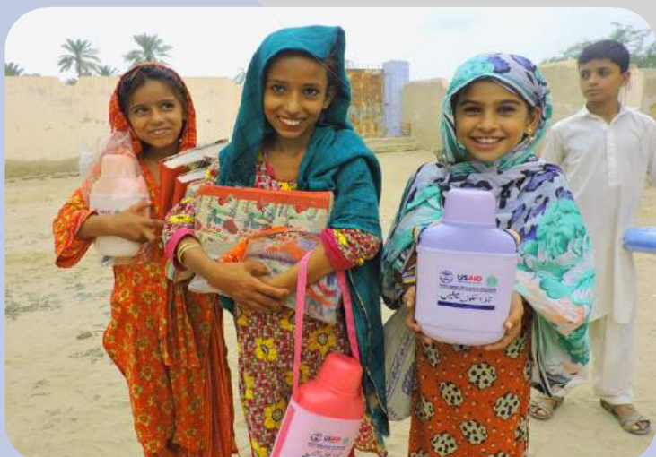
Water flasks distributed among students