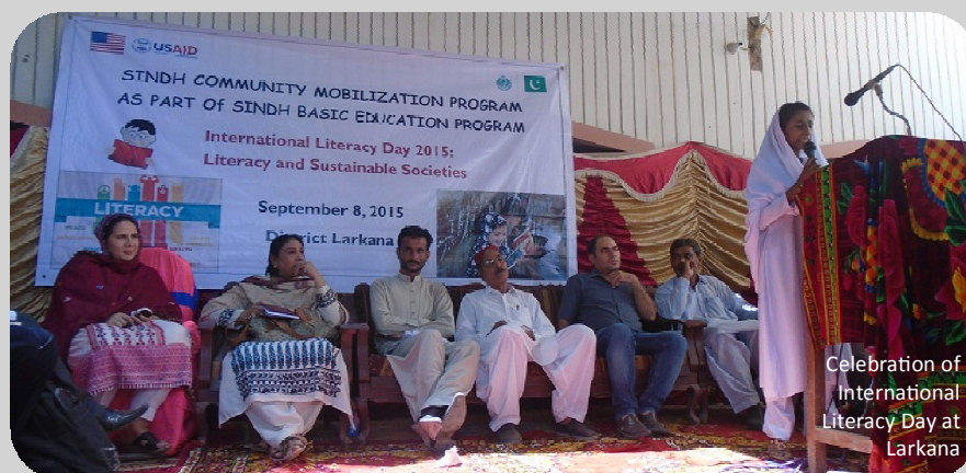
Celebration of International Literacy Day at Larkana

CMP organized 'International Literacy Day' on September 8, to highlight the significance of Literacy in Sindh. In nine events 2,811 participants (Female 1,333 & Male 1,478) participated.