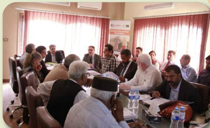
11th Steering Committee meeting held at PMIU, Karachi.