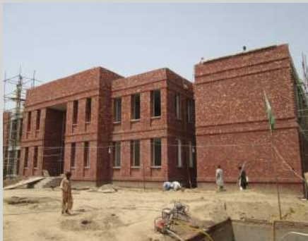
GBHS Jajh Regulator, Khairpur