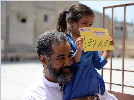
Lifting reading standards to new heights: SRP Chief of Party and a little school girl carrying the message of 'Read to Lead' this Literacy World Day

On the World Literacy Day (September 8), SRP staff engaged with girl students at GGPS Intelligence No 1 School, Kemari and read out to them in interactive sessions. SRP celebrated the Day to focus public opinion on the root cause of illiteracy: lack of reading skills.