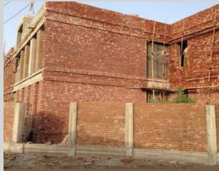
GBES Koro Goth, Khairpur