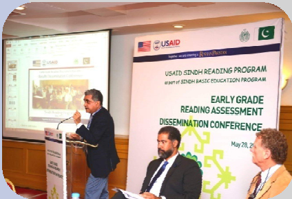
Secretary Education, Dr. Fazlullah Pechuho officially opening the EGRA dissemination Workshop.

SRP conducted consultation workshop at the regional level for a broader dissemination of results of the Early Grades Reading Assessment (EGRA). Altogether four workshops were conducted for all eight program districts. District-wise EGRA baseline results were shared with District Education Management and other stakeholders. Workshops were held during July 2-11, 2015.